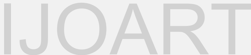
TABLE NO.1 SHOWING DIFFERENT STAGES OF LICHEN DEVELOPMENT

The second method of dating is the lichen analysis which evident as the evolutions of Kedernath Valley. The most common lichen growing on the morainic boulders is Rhizocarpon geographicum . It belongs to yellow–green section of Rhizocarpon most frequently used in lichenometry. The longest axis of all the lichens of the species growing on the upper faces of selected boulders were measured with a flexible tape and digital caliper, with measurements estimated to nearest 1 mm; about 185 lichens in the region were measured on different moraines and their size distribution was plotted to display relative dating.