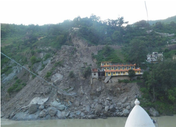
Photo 3: Many houses damaged due to landslide in Devprayag, Uttarakhand