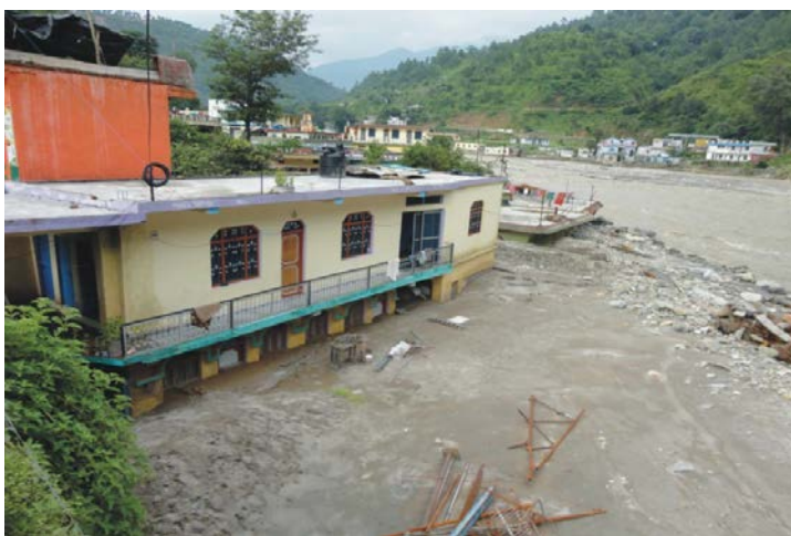
Photo 1: Buildings damaged due to 16-17 June 2013 floods in Rudraprayag

Incidences of landslides along with erosion by the sediment loaded rivers breached of roads/highways at many locations and washed away bridges (steel girder bridges, beam bridges, suspension/cable bridges). Traffic was disrupted along all national highways and link roads besides disruption of telecommunication lines, all these delaying emergency response operations and creating grounds for lasting disaster impact.