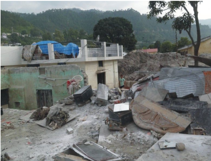
Photo 4: Residential buildings damaged due 16-17 June, 2013 flood disaster in Srinagar