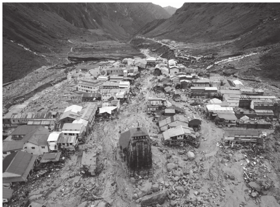
Figure 3 View of the Kedarnath township ravaged by the flood of June, 2013 with camera looking south.

Continuous rains caused the level of water in Chorabari Tal to rise. With the recession of the glacier the lake had a weak moraine barrier that could not withstand continuously rising hydrostatic pressure. Stage was thus set for a major disaster in Kedarnath and the barrier gave way around 0700 hrs on 17 June 2013. The volume of water was enormous and it carried with it huge glacial boulders and outwash material that choked the western channel of Mandakini and the flow of