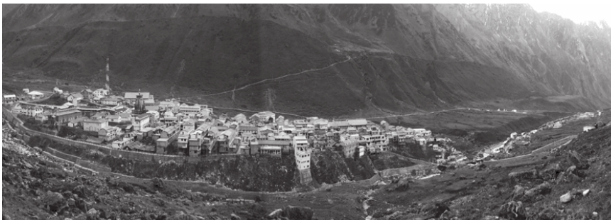
Figure 1 View of the temple township of Kedarnath, with camera looking east.

Mandakini valley is located in Higher Himalaya in Rudraprayag district of Uttarakhand and has witnessed as many as four glaciations in the previous 15,000 years and evidences of glaciation in the valley are observed till Rambara 1 . The temple township of Kedarnath is located on glacial outwash deposits at an altitude